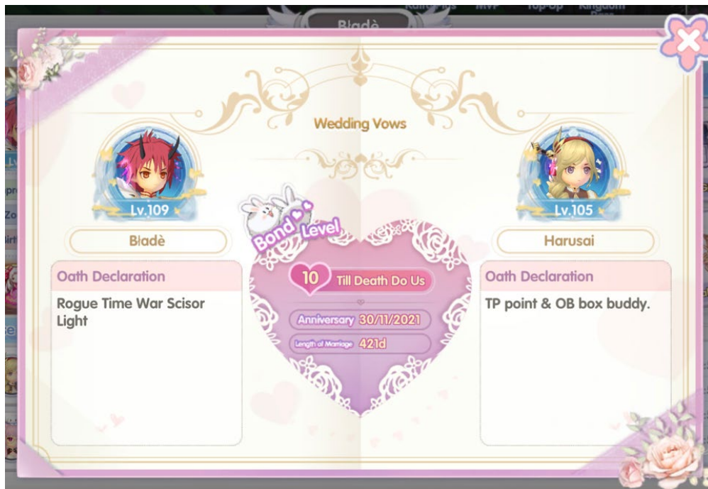
Figure 5. Couple Feature

In-game marriage tied two players to be husband and wife and activate the couple skills feature. This married status also gives some monthly rewards. Marriage in ROX is also give costume and mount. The costume is given for the couple from the wedding ceremony or their friends from the wedding feast. Some players have commercialized the wedding feast and sold the witness suit. Most of the participants do not pay for the marriage because they only get the wedding ceremony for the couple. They can collect and save the materials needed for the wedding quest. Real money is used in this feature to make the progress of wedding quest and wedding feast faster.