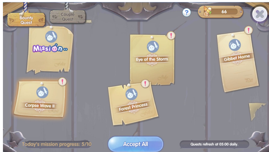
Figure 2. Mission Board for Daily Quest

There are several ways to collect currency in the game in ROX. Some activities directly give currency to the players and some other activities need trading to convert the loots into currencies. Universal basic income in this game is the Daily Mission. Players come to the Mission Boards to get ten quests per day. The rewards for doing the quest. Every player also gets quota for daily and weekly dungeon raids. Players can go hunting the boss monster to get loots which can be sold as premium items. There are also life skill features to collect sellable materials such as mining, fishing, gardening, smelting, and cooking. A special class such as the merchant branch can do crafting, while the knight branch can craft a rune. Players can also collect zenry and materials through mob grinding. This is when players continuously kill specific regular monsters.