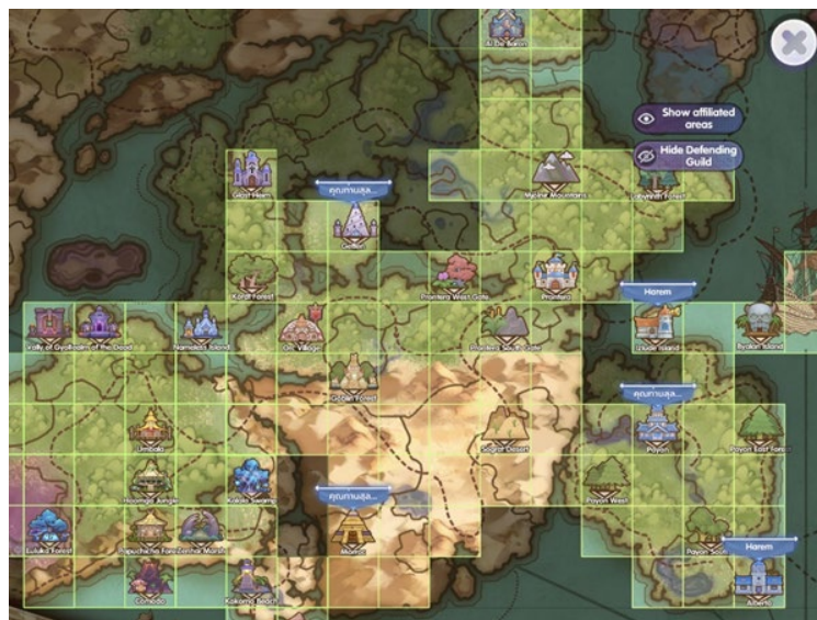
Figure 1. Map of Rune Midgard

There are three types of major currency in this game, which are zeny, crystals, and diamonds. Virtual economy in this virtual world of ROX is built by interaction between players and non-playable character (NPC). The trading activities are conducted in the exchange center, the merchant NPCs and the merchant players' stalls. In this game, only the merchants job class can make direct transactions between players.