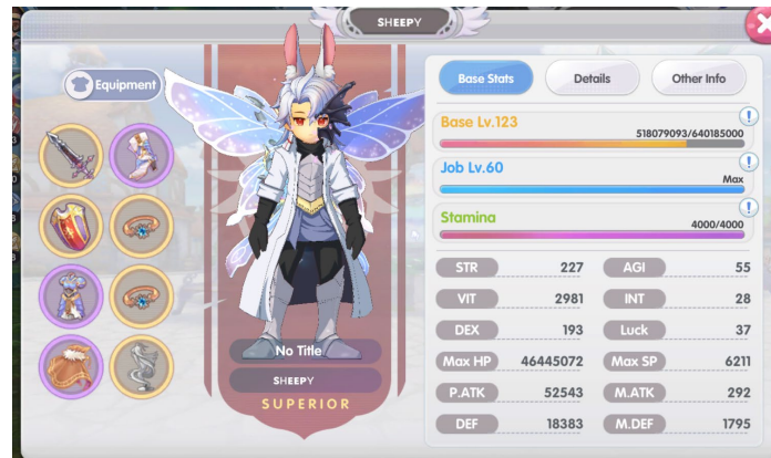
Figure 3. Avatar

“if the costume is worth it, I’ll spend a necessary amount, especially limited ones, but if not so rare i just play the game and complete quest that is needed to obtain the costume.” (Zenchaos)